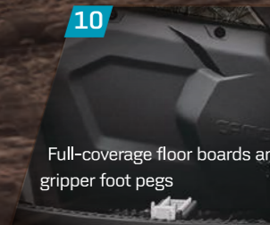
Full-coverage floor boards and gripper foot pegs