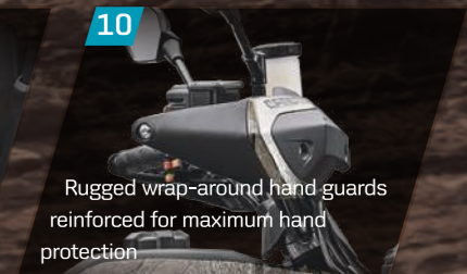
Rugged wrap-around hand guards reinforced for maximum hand protection